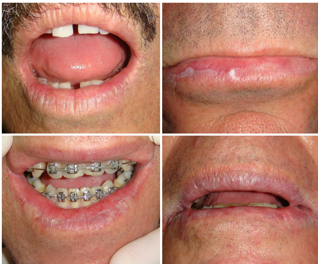
Figure 1: Clinical photos of actinic cheilitis (AC) reference for applying the Poitevin classification, 2017 – A: AC grade I - fissure and desquamation; B: AC grade II - atrophy of the vermilion lip, leukoerythroplastic and brown color changes, shallow fissures and beginning to lose definition of the boundary between lip and skin; C: AC grade III - rough, dry and hyperkeratotic regions; and D: AC grade IV - change in color throughout the lip, deep fissures and swollen lip appearance, with a heterogeneous leukoerythroplastic lesion speckled on the right, suggestive of malignancy.